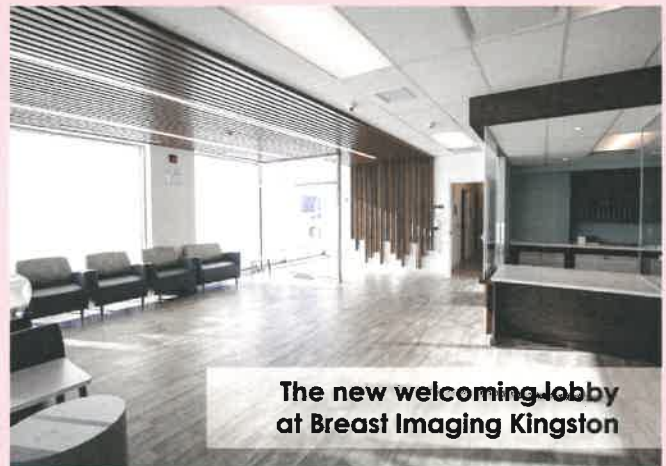
The new welcoming lobby at Breast Imaging Kingston