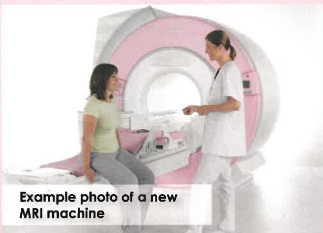
Example photo of a new MRI machine