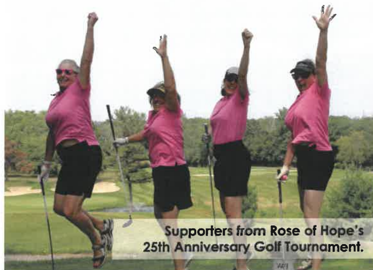
Supporters from Rose of Hope's 25th Anniversary Golf Tournament.